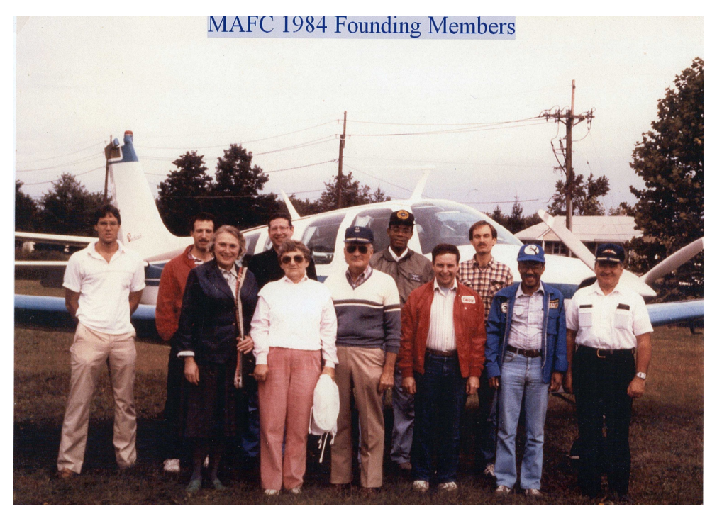
Can you name any of these MAFC founding members?

Like the Fort Monmouth Army Flying Club, The MAFC initially had a restricted membership limited to military and civilian personnel of the Department of Defense. This restriction was in accordance with requirements set forth by the Allaire Airport authority. Some years later, the club received permission from the Allaire Airport to allow personnel working at Bell Laboratories to join. In April 1995, the club left Allaire Airport and set up operations jointly at Marlboro Airport and Lakewood Airport. Subsequent to this move the membership became unrestricted and the club continued to grow. When Marlboro Airport was closed in September of 2002, the club relocated it's total operation to Lakewood Airport where it is still based today.