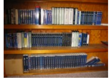
New Media Center Library