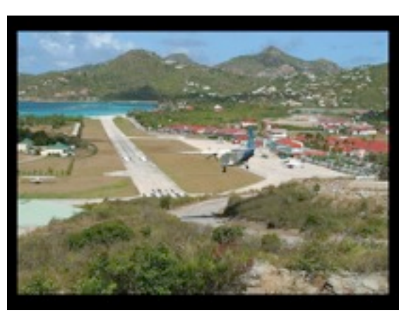
Can you identify this airport?