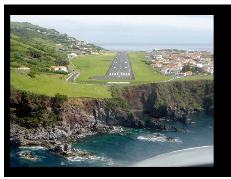
Can you identify this airport?