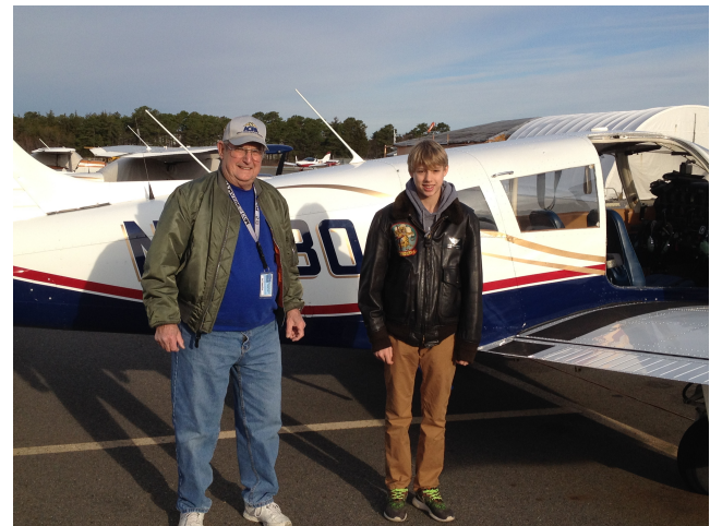
3 MAFC Aircraft at McGuire