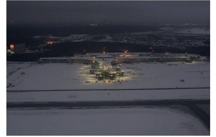
Takeoffs are optional but landings are mandatory!