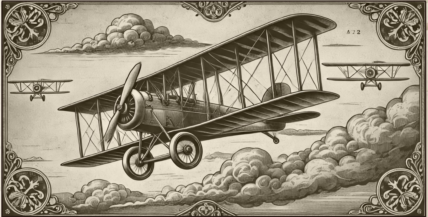
An artistic sketch of the Wright Flyer soaring above the dunes of Kitty Hawk, with observers watching in awe.